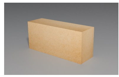
Shipping Carton 580*285*185mm(100PCS)